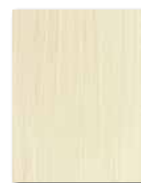
WARKB016 62 | m 2 mat | matt