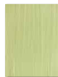
WARKB018 62 | m 2 mat | matt