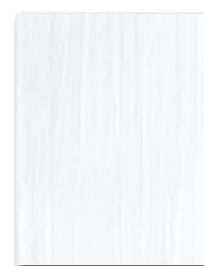
WARKB015 62 | m 2 mat | matt