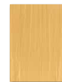
WARKB017 62 | m 2 mat | matt