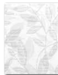
WITKB090 58 | ks mat | matt