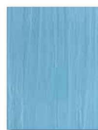
WARKB019 62 | m 2 mat | matt