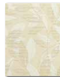
WITKB091 58 | ks mat | matt